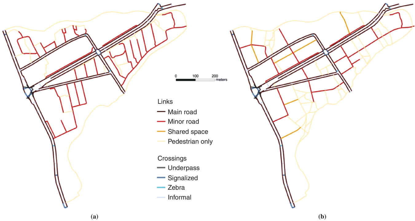
FIGURE 2 Pedestrian network: (a) pre-redevelopment and (b) post-redevelopment.