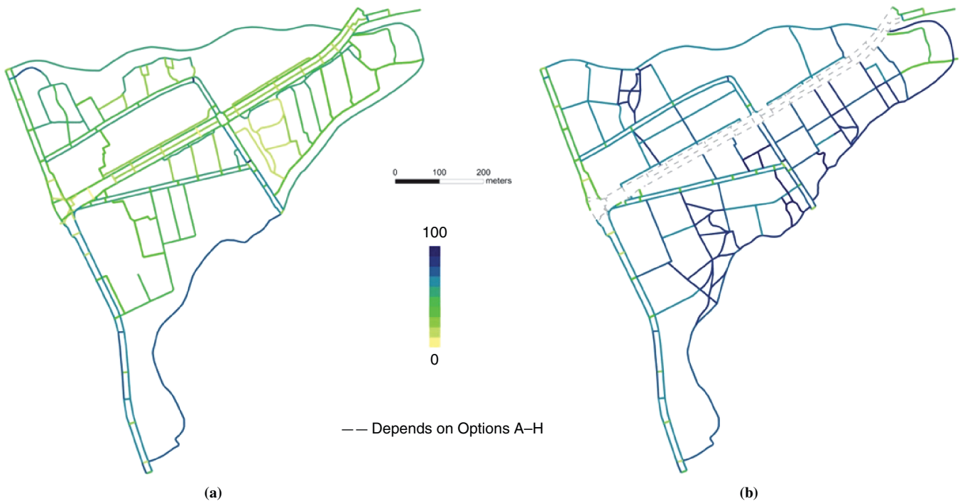
FIGURE 3 PERS scores: (a) pre-redevelopment and (b) post-redevelopment.

Figure 3 shows the striking difference between the PERS scores in the pre- and post-redevelopment scenarios. The poor scores of Seven Sisters Road in the pre-redevelopment case are explained by the presence of barriers that are not related with motorized traffic, such as sidewalk obstructions, conflict with other users, and lack of dropped curbs at the many junctions with side roads and entrances to garages. However, some links that could provide an alternative to walking along Seven Sisters Road also fare poorly because of problems such as sidewalk parking and poor lighting. The scores in the post-redevelopment scenario are above 50% in most cases except in Green Lanes and in the Eastern part of the neighborhood (which is excluded from the redevelopment program).